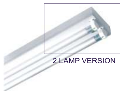
2 LAMP VERSION

BATTEN: The batten is a narrow open channel fitting supplied with energy saving electronic control gear for use with T5 16mm and T8 26mm fluorescent lamps