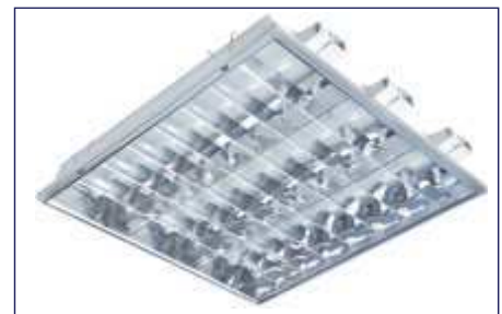
FM 90 DLB LOUVRE

VDU LOUVRE – Visual display louvre. With a critical cut off angle the VDU louvre provides the ultimate in brightness control. A typical installation would be in a control tower at an airport, consists of Specular high reflective 350G aluminium