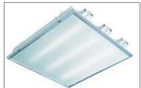
FM 90 AR27 DIFFUSER