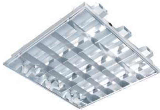
FM 90 LLB LOUVRE

FM90: luminaires are designed for maximum efficiency for use with T8 26mm diameter lamps. Careful attention has been paid to glare control in all versions, the AR27 diffuser features a conical prism design which reduces surface brightness. Louvre and diffuser systems are interchangeable – without having to change the luminaire