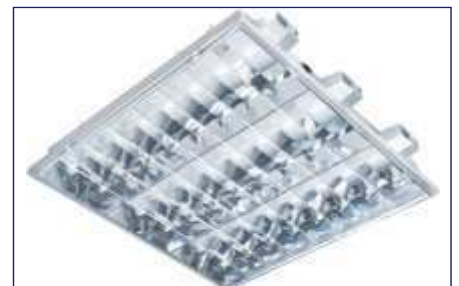
FM90 VDU LOUVRE