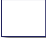
FM90 336 ELB/DLB